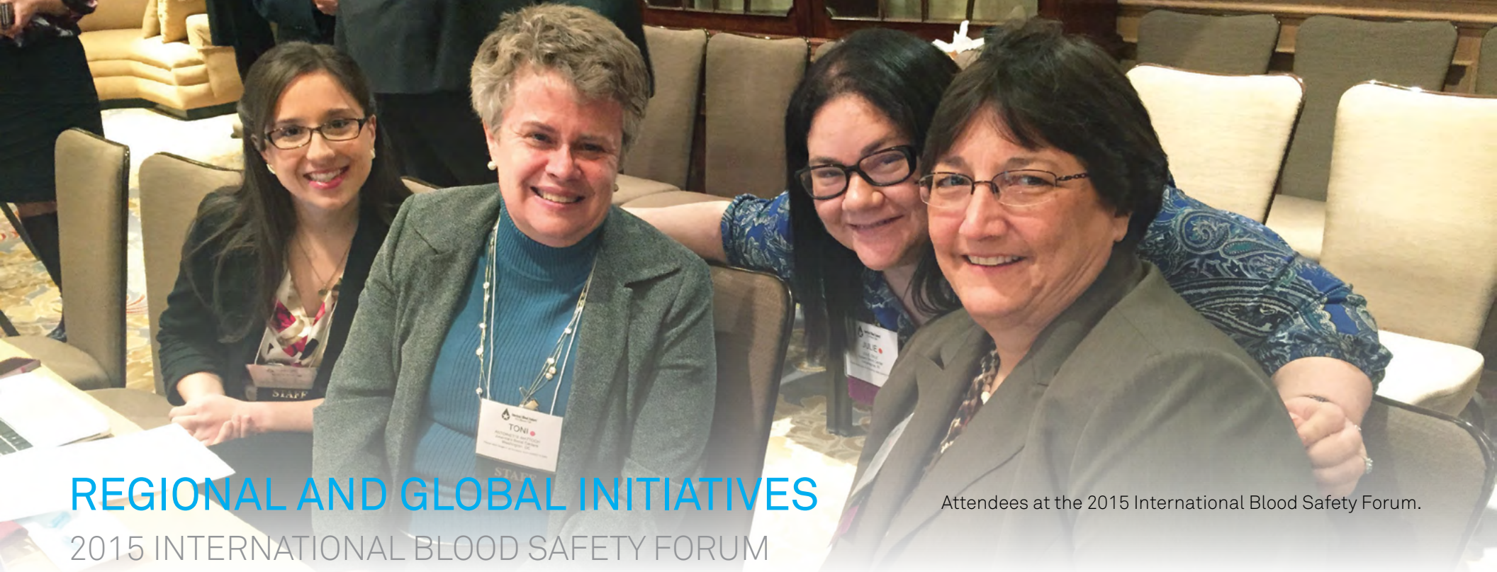
Attendees at the 2015 International Blood Safety Forum.