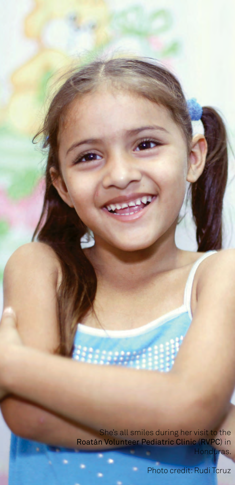
She's all smiles during her visit to the Roatán Volunteer Pediatric Clinic (RVPC) in Honduras.