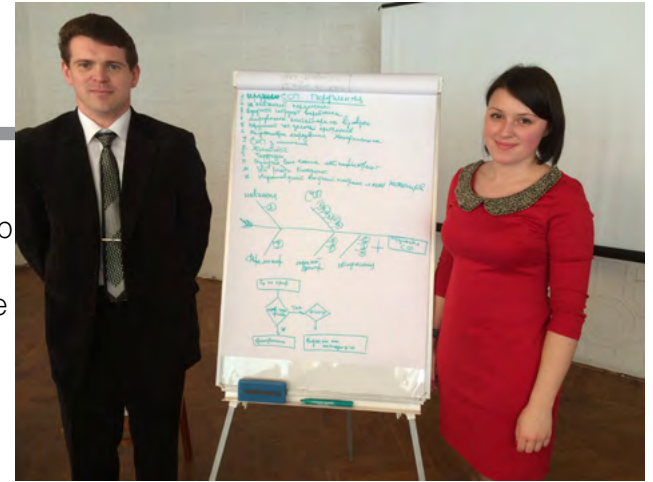
Above, training participants summarize the results of a Continuous Quality Improvement exercise that uses case studies based on real errors made in a U.S. blood center.