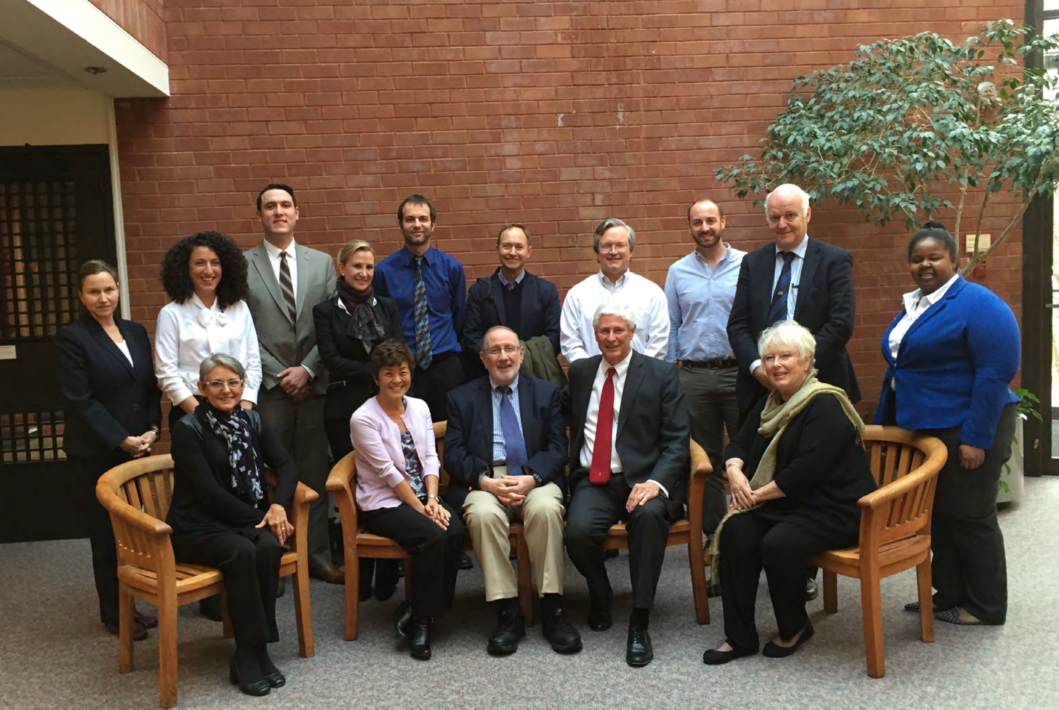
Bethesda, MD: In March of 2015, Global Healing met with stakeholders at the AABB offices to discuss international blood safety efforts the day prior to the 2015 International Blood Safety Forum.