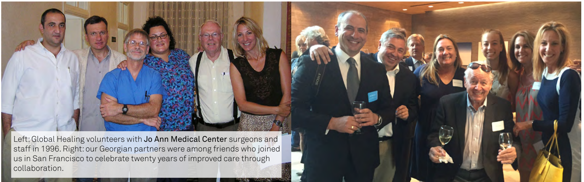
Left: Global Healing volunteers with Jo Ann Medical Center surgeons and staff in 1996. Right: our Georgian partners were among friends who joined us in San Francisco to celebrate twenty years of improved care through collaboration.

Many thanks to Pyramid Brewery and Honig Winery for sponsoring our event.